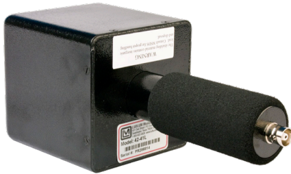
left: Model 42-41L Neutron Detector